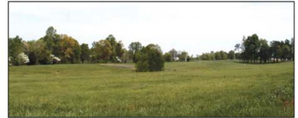
Carter's Farm features gently rolling hills and large hardwoods. Homesites range from .75 to 2.2 acres.