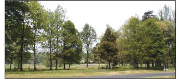
Choose from wooded and open lots in this lovely, tranquil setting.

Fax 704.872.2678 • www.piedmontauction.com