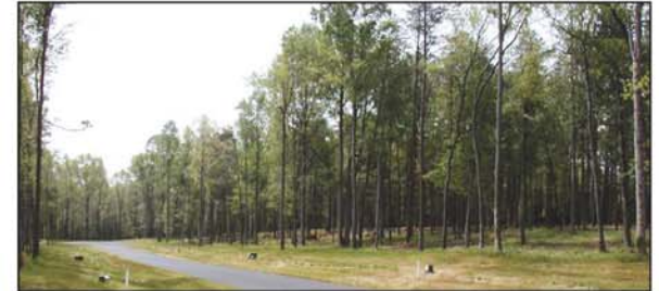
Cul de sacs create variety of homesites and prevent thru traffic.