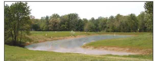
A limited number of homesites have pond access.